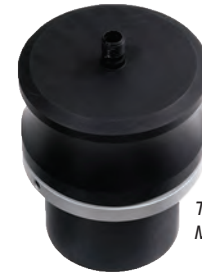
The MFA-PT Phototubus Microscope Adapter