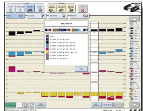
Complete information at a glance!