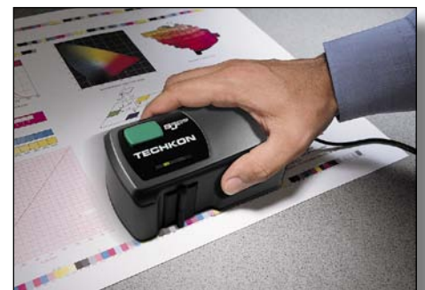
Works with any color bar!